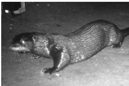
Motion-sensor photographs of animals in box culvert: from top, bobcat, alligator, and otter

inches × 7 feet 10.5 inches (2.4 meters × 2.4 meters)], because two box culverts were completely inundated throughout the study. Funnel traps and hardware cloth traps were used at the other sites. In addition, researchers examined animal tracks and used active infrared cameras at the dry culverts.